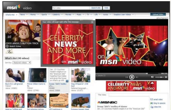
Source: MSN Video Player

In MSN's Video Player example to the right, a Linear video ad plays before the video content and is accompanied by a clickable, expanding 300 X 250 display companion ad product.